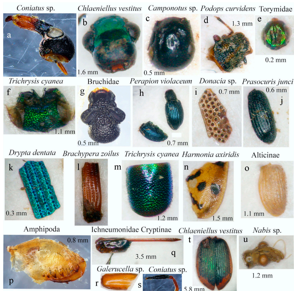
Figure 2. Prey found in the fecal samples of the Reed Warbler and their size: (a) Coniatus sp. (Curculionoidea, head); (b) Chlaeniellus vestitus (Carabidae, head); (c) Camponotus sp. (Formicidae, head); (d) Podops curvidens (Heteroptera, head); (e) Torymidae (Hymenoptera, head); (f) Trichrysis cyanea (Crysididae, head); (g) Bruchidae (Coleoptera, head); (h) Perapion violaceum (Apionidae, elytra and pronotum); (i) Donacia sp. (Chrysomelidae, elytra remains); (j) Prasocuris junci (Chrysomelidae, elytra); (k) Drypta dentata (Carabidae, elytra remains); (l) Brachypera zoilus (Curculionoidea, elytra remains); (m) Trichrysis cyanea (Chrysididae, abdominal segment); (n) Harmonia axiridis (Coccinellidae, elytra remains); (o) Alticinae (Chrysomelidae, elytra); (p) Talitridae? (Amphipoda, gnatopode); (q) Hymenoptera Ichneumonidae Cryptinae (ovipositor and one ovipositor sheath); (r) Galerucella sp. (Chrysomelidae, elytra remains); (s) Coniatus sp. (Curculionoidea, leg); (t) Chlaeniellus vestitus (Carabidae, elytra); (u) Nabis sp. (Heteroptera, head).