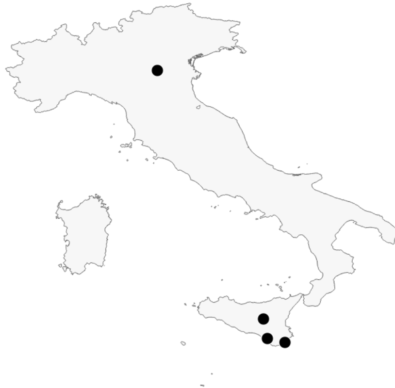
Figure 1. Location of study areas.