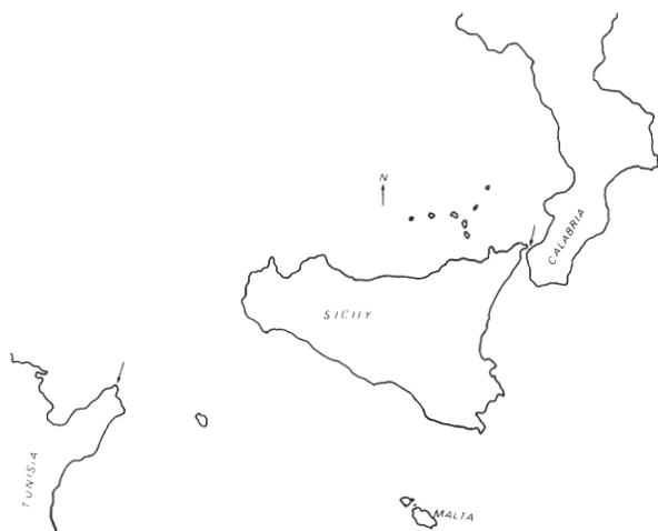
Fig. 1: The study area.

possible to identify individuals, thanks to particular features of their plumage (broken or missing remiges and/or rectrices) or entire flocks, through particular interspecific associations, transit again over our observation posts after an hour or, in the case of the former, repeatedly over several days and thereby avoid recounting the birds. Individuals were seen returning to the coast after disappearing over the sea.