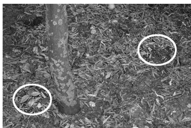
Figure 2. Two Holm Oak seedlings close to a lemon tree in a cultivated orchard in Fondo Micciulla, Palermo, Italy.