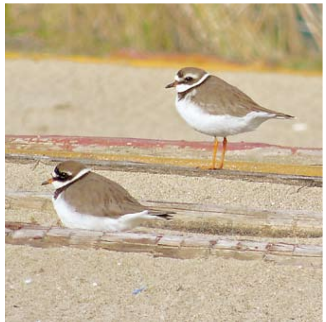
Fig. 3 - Common ringed plovers resting near to Canale Arci's mouth in January 2017. / Corrieri grossi a riposo nei pressi della foce del Canale Arci a gennaio 2017.

Regularly observed every year, usually in groups of 10-20 individuals, mainly near freshwater stream mouths; very constant numbers through the years, with maximum of 23 individuals recorded in 2012 and exactly 22 observed in 2013, 2014, 2015 and 2017 as well. A peak of 51 was recorded on 10 January 2016: 31 together at River San Leonardo's mouth, Transect 4, and 20 at Canale Arci's mouth, Transect 2: these sites resulted the most important along the coastline of Catania's Gulf for